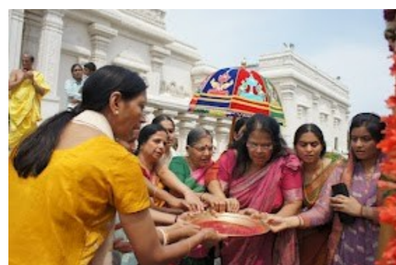
Lord Jagannath Bahuda Ratha Yatra July - 2012