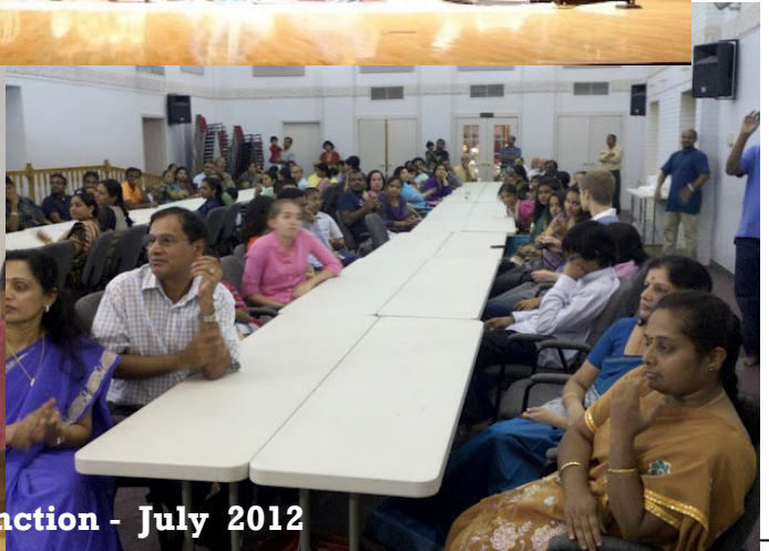
Skanda Pooja and Dinner Function - July 2012