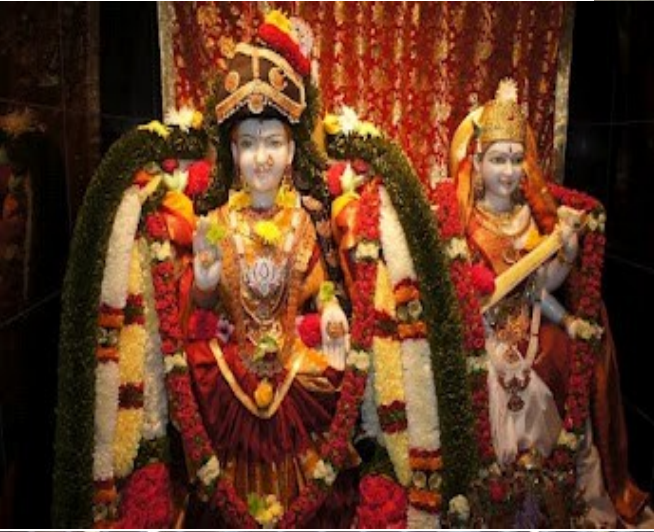
Varalakshmi Pooja July - 2012