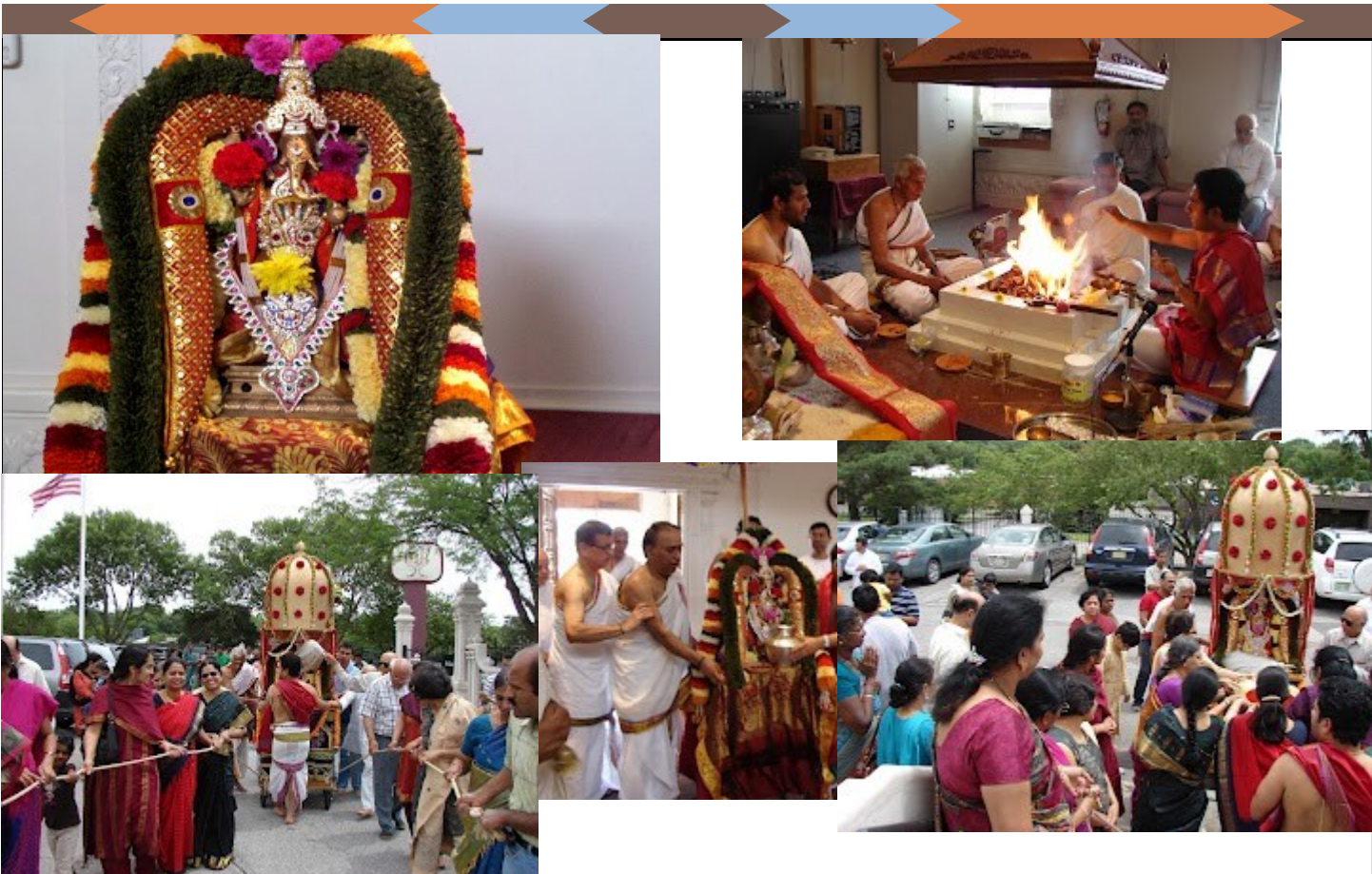
Brahmothsavam Function - June 2012